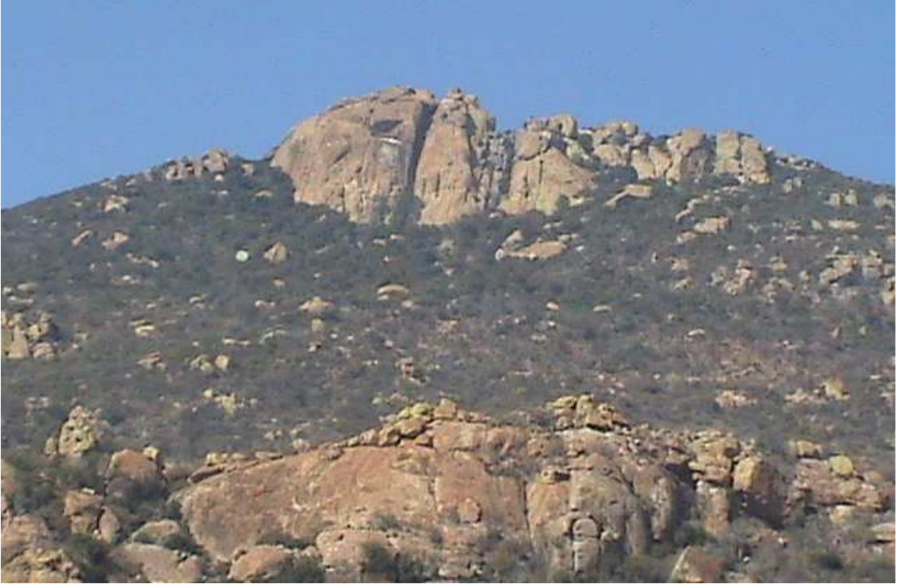
Mogoshi Mountains in Matlala a thaba (Ward 16)